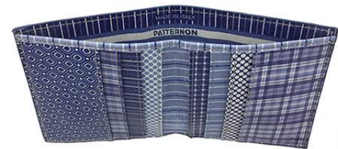
#paulwallet 100% real leather hand made in Italy