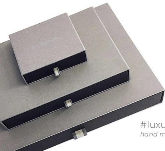
#luxury drawer boxes hand made in Italy