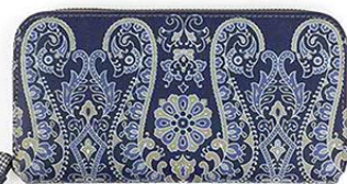
#maxwallet 100% real leather hand made in Italy