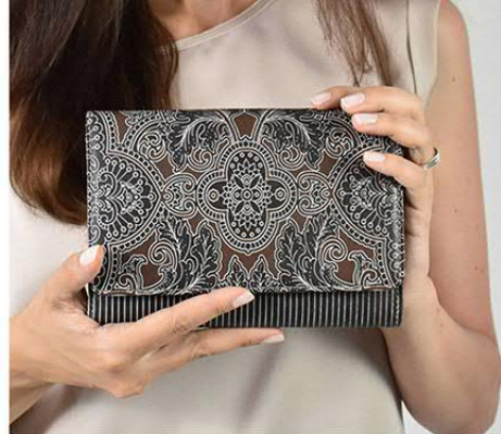
#miniclutch 100% real leather hand made in Italy