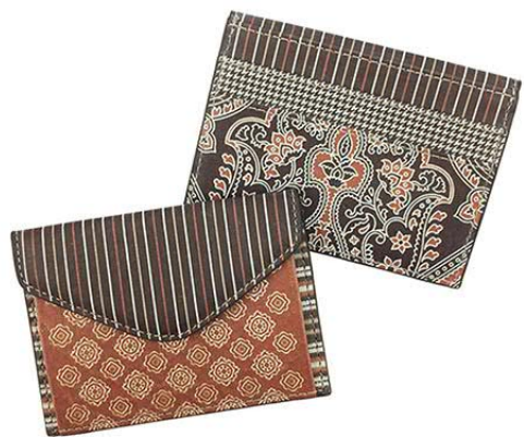
#cardholder & #coincase 100% real leather hand made in Italy