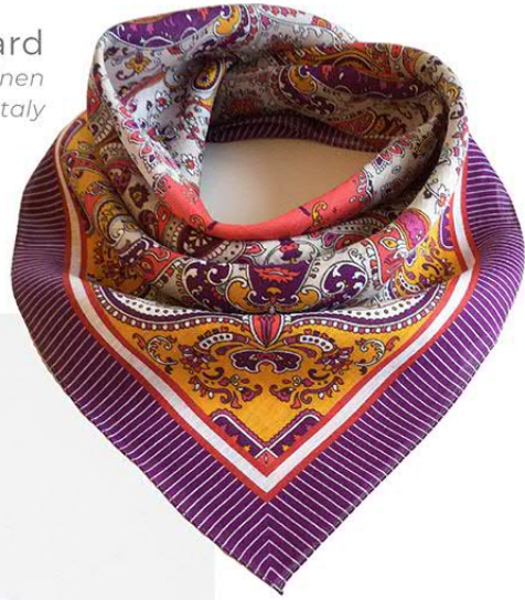
#foulard 100% superfine linen hand made in Italy