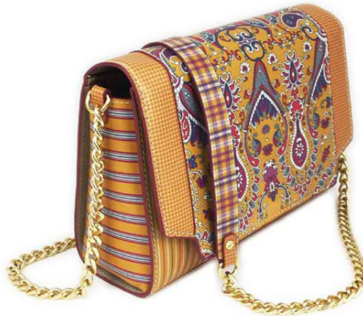
#patty bag 100% real leather hand made in Italy