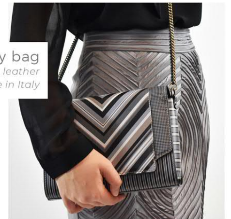
#patty bag 100% real leather hand made in Italy