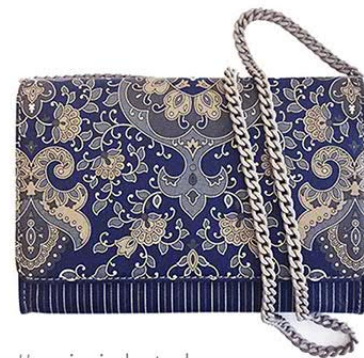
#miniclutch 100% real leather hand made in Italy