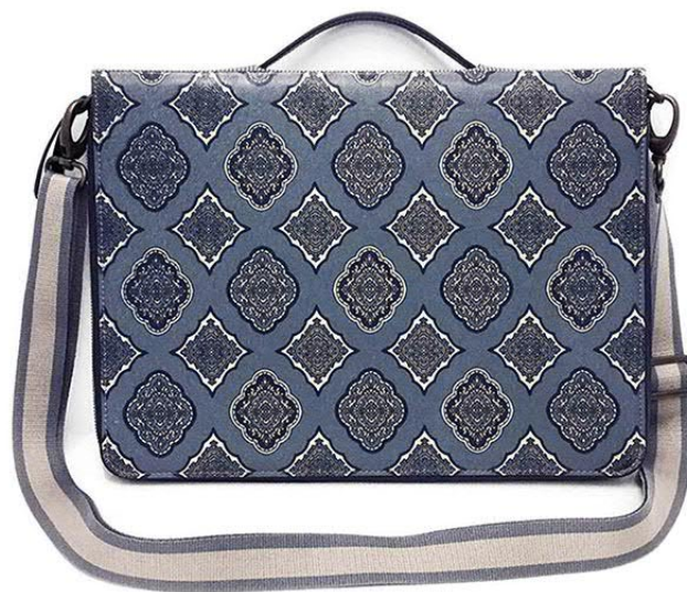
#portfolio bag 100% real leather hand made in Italy