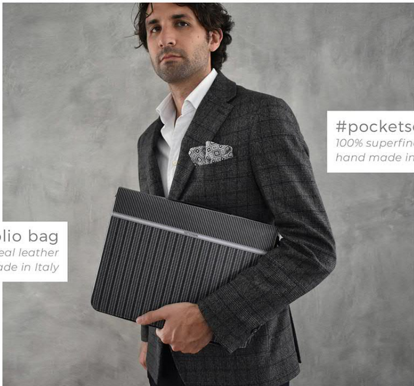
#portfolio bag 100% real leather hand made in Italy