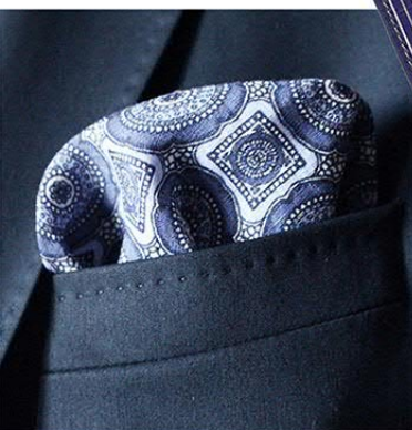
#pocketsquare 100% linen superfine fabric hand made in Italy