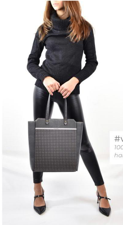
#vertical tote 100% real leather hand made in Italy