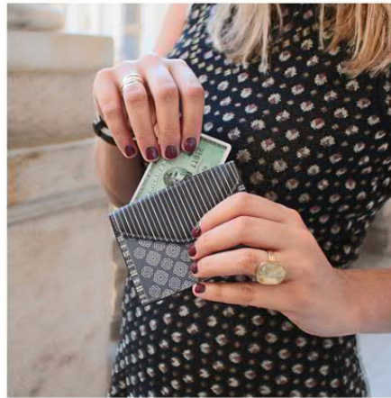
#cardholders & #coincase 100% real leather hand made in Italy