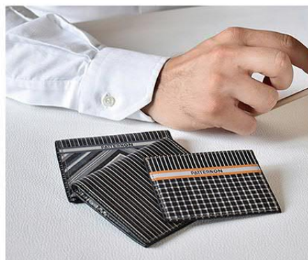
#wallets 100% real leather hand made in Italy