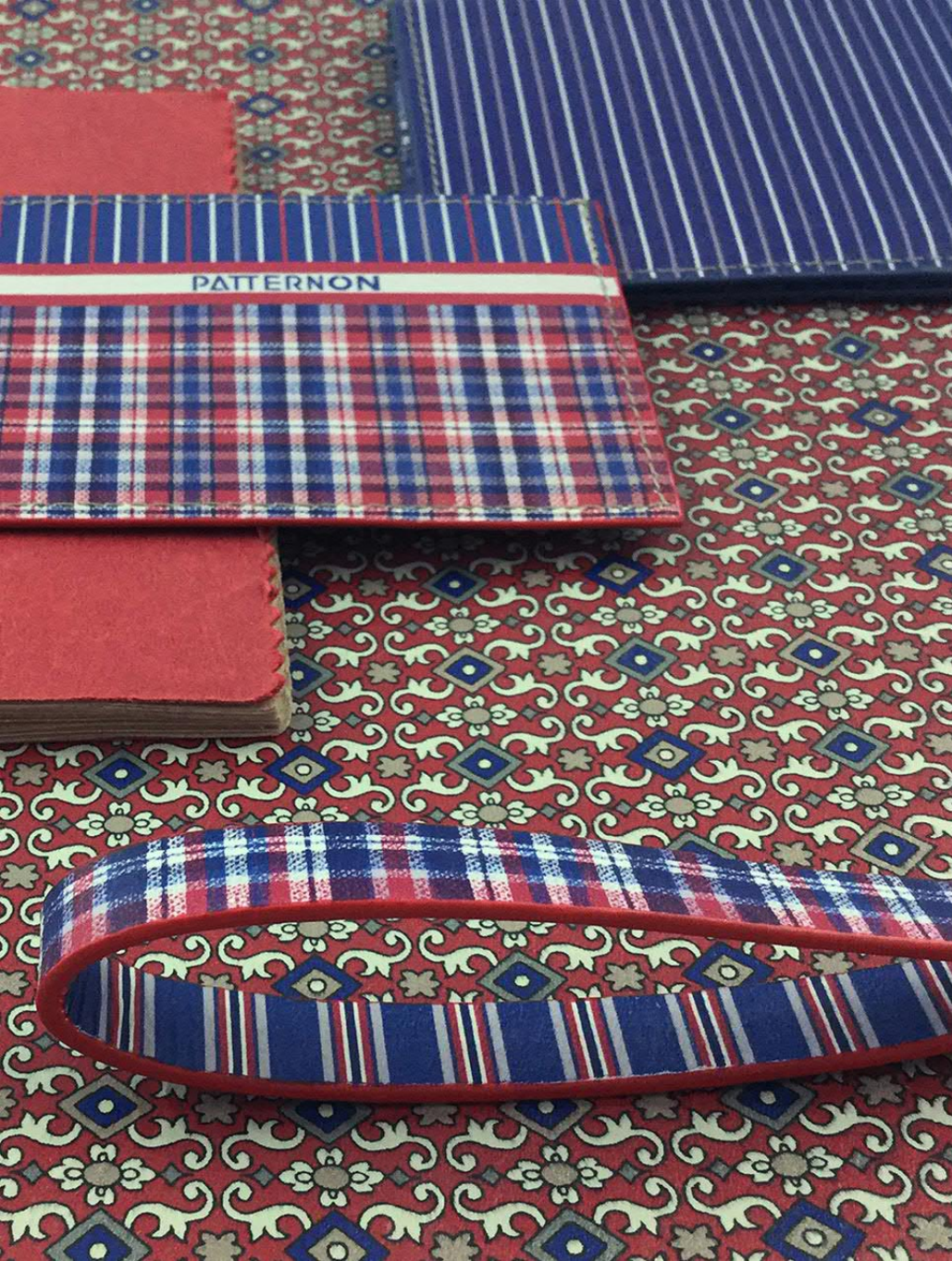
#portfoglio bag 100% real leather hand made in Italy